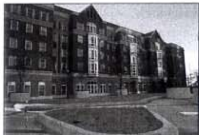
Residential halls in the Olympic village.