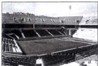
Tennis centre, Stone Mountain.