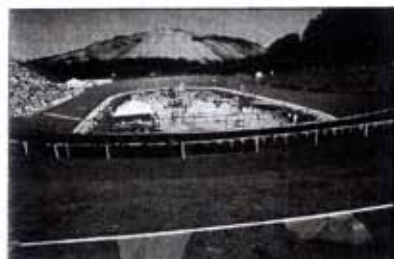
Stone Mountain's new cycling venue.

Atlanta - seizing the baton of renewal presented by the Olympics, or falling by the architectural wayside?