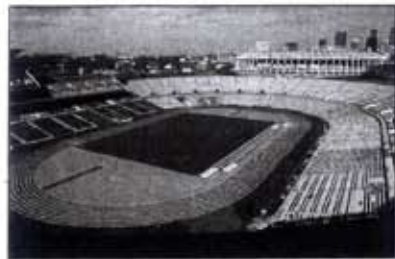
The main Olympic stadium in Atlanta.