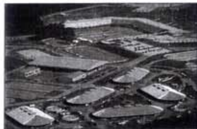
Georgia's International Horse Park.