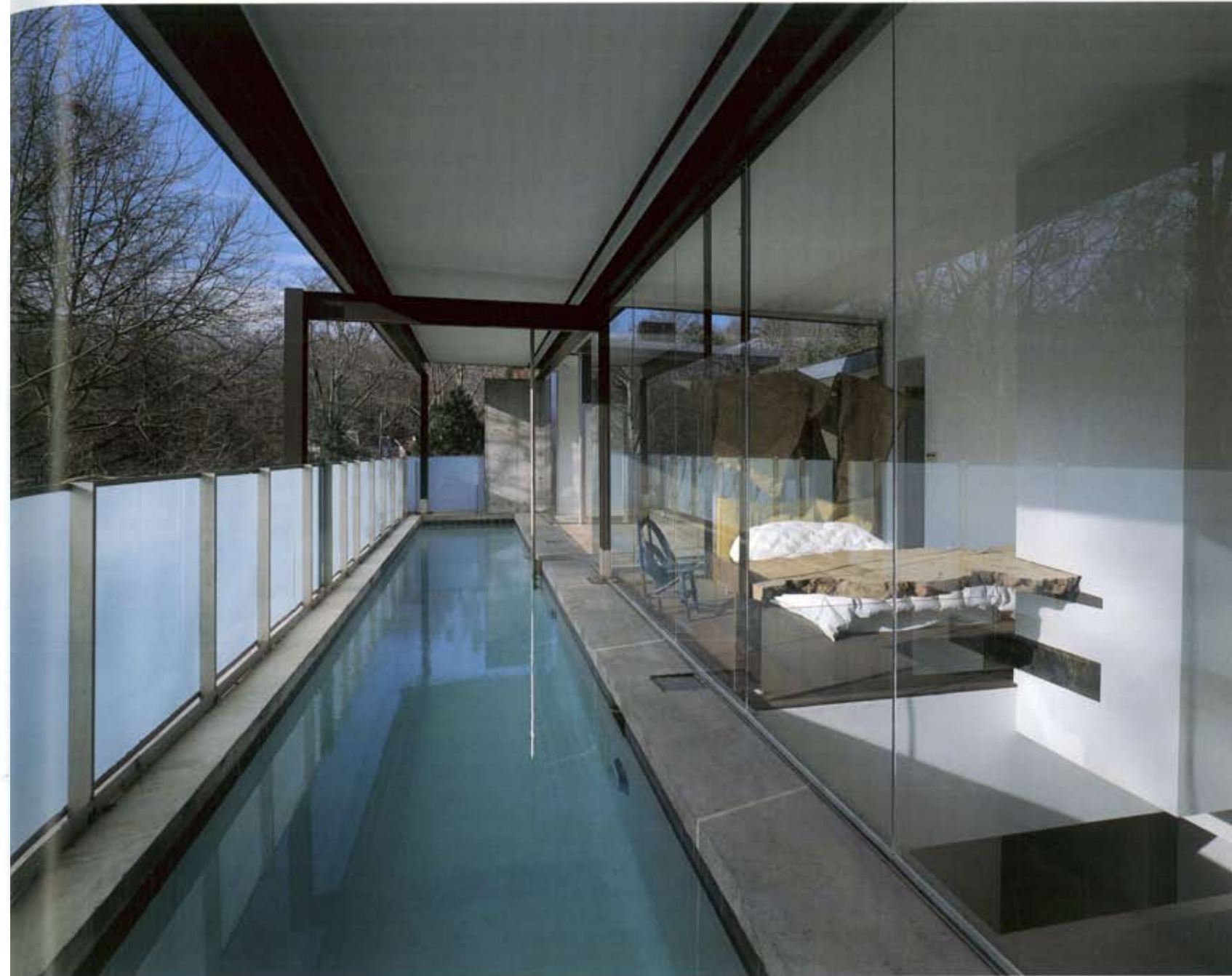
View into master bedroom from lap pool