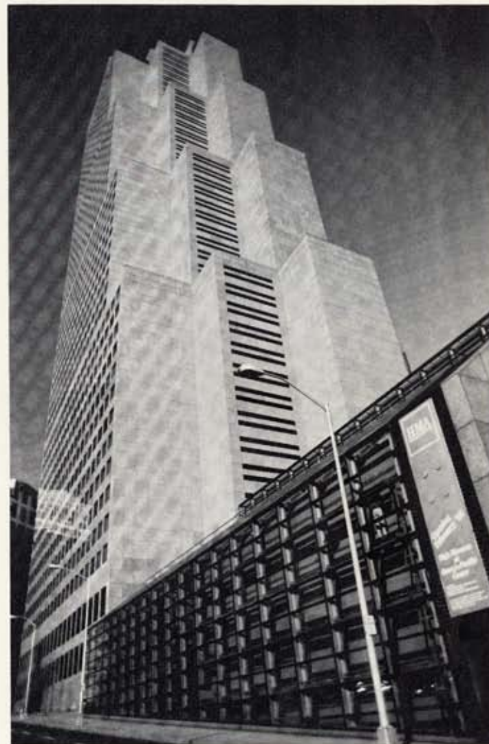
The High Museum at Georgia-Pacific Center

During the opening weeks of the new facility, coupons will be offered to all visitors who are not members. For a limited