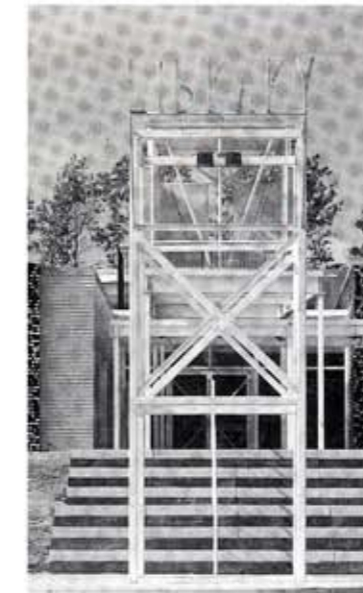
Projects completed by the firm of Scogin Elam and Bray Architects. Above and below left: Clayton County Headquarters Library, Jonesboro, Georgia. Above right: WQXI Radio Station Headquarters, Atlanta. Below right: High Museum at Georgia-Pacific Center, Atlanta.

what the new position means to him. "Part of the task of educating architecture professionals is to pass on a set of values, including integrity, rigor, discipline and commitment to the field in the broadest sense," he said. "I hope to impart these values to students and add to them the values involved in the practice of architecture through the knowledge and experience I have gained over twenty years of work in the field."