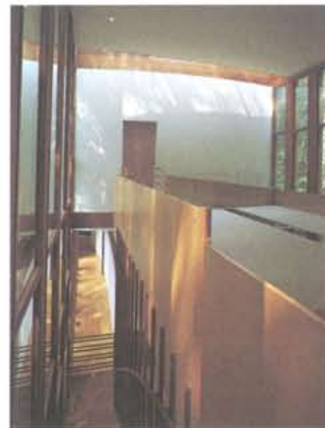
LEFT Turner Village at Chandler School of Theology, Emory University, Atlanta, completed fall 1989.