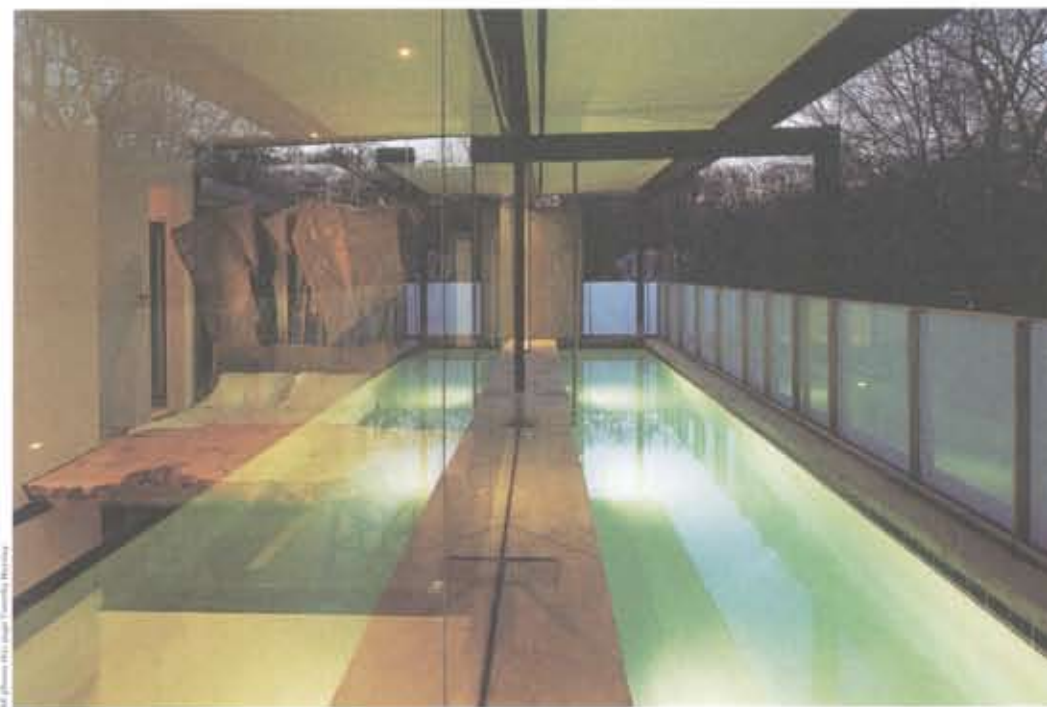
Wakefield Drive, Architectural Record, April 1998.